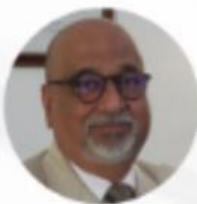
Mansur Dalal Chair