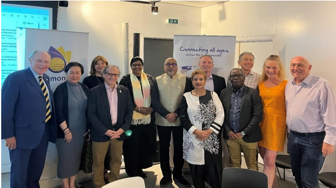
Board members and core supporters past and present – September 2023