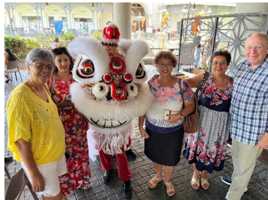
Marking Chinese New Year with friends from FIAPA – Mauritius in Port Louis