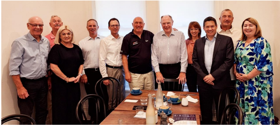
A reunion with CommonAge Founding Members and supporters in Adelaide, South Australia