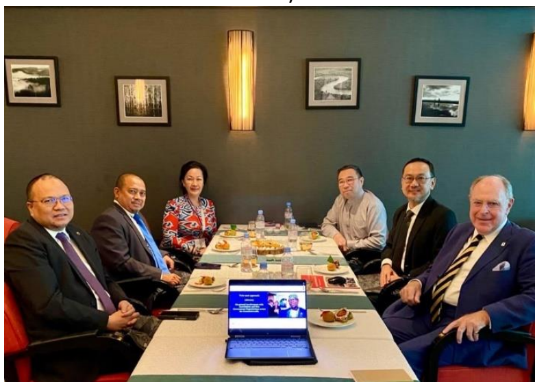
Meeting with Minister of Health, Dato Paduka Dr Haji Md Isham bin Jaafar and ministry officials

was attended by ministers and senior officials from five ministries: (1) Health; (2) Culture, Youth, and Sports (with the portfolio of older persons, youth, and social welfare); (3) Home Affairs; (4) Education; and (5) Finance and Economy. Invitees include High Commissioners of several Commonwealth countries; international and regional institutions and NGOs: the International Institute on Ageing United Nations-Malta; ADI–Asia Pacific; ASEAN on Women’s Rights; Universiti Brunei Darussalam; Osaka University; and collaborative partners. Also attending were selected international experts on ageing and dementia for the ADI APRC 2023 hosted by dB from 27-29 October.