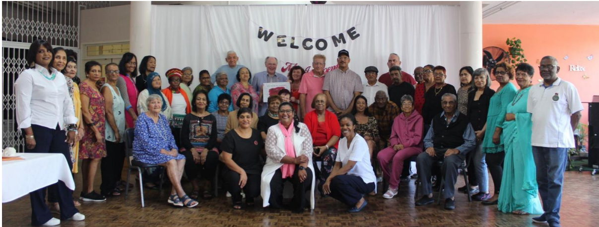
Meeting residents and staff of TAFTA