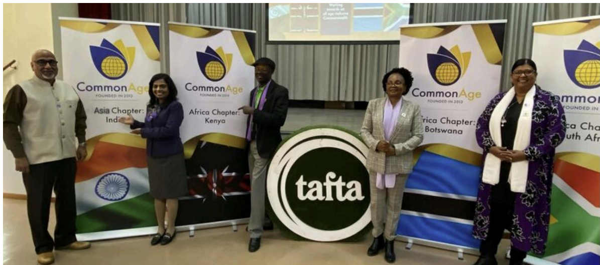
Launch of India, Kenya, Botswana and South Africa Chapters