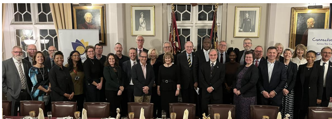
10 th Anniversary Dinner at HM Tower of London