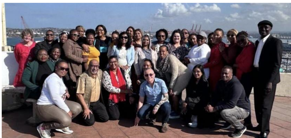
Train the Trainer Participants – Durban, South Africa, June 2024

11. Train the Trainer Programme. This free training programme for those delivering elder care in developing countries was held in Durban South Africa, between June 10 to 21, 2024. With a special focus on ageing in Africa, the training programme, led by CommonAge director and US Fulbright Specialist - Dr Renu Varughese, aimed for enhanced elder care outcomes through international collaboration, emphasising knowledge sharing and capacity building. 28 delegates from 3 countries participated in the programme and they, in turn, are now scheduled to train more in their own respective countries in a ripple effect. This programme was supported by the prestigious Fulbright Specialist programme, known for its global impact and aligned perfectly with the CommonAge vision of fostering collaboration and expertise exchange. The Train the Trainer programme arose out of an aligned vision for enhanced practices in supporting older persons, with a special focus on dementia care. This practical solution resulted from a collaborative effort, exemplifying how like-minded organisations can amplify their impact through partnership. This highly successful pilot project now provides an important template from which to develop further such projects across the Commonwealth, thereby having a direct impact on the quality of aged care services and life enhancing outcomes for older persons. See full report at: TRAIN THE TRAINER Project Proposal (commage.org)