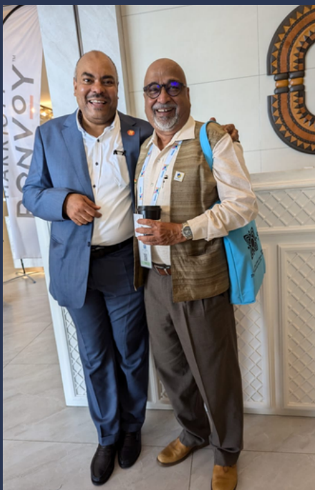
Minister of Foreign Affairs , Tanzania